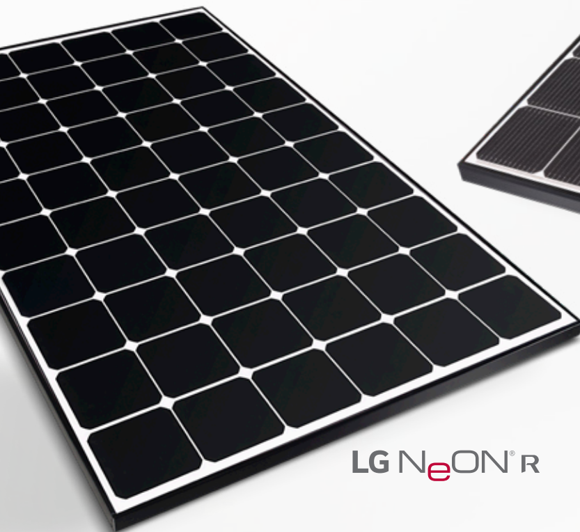
LG NeON ® R