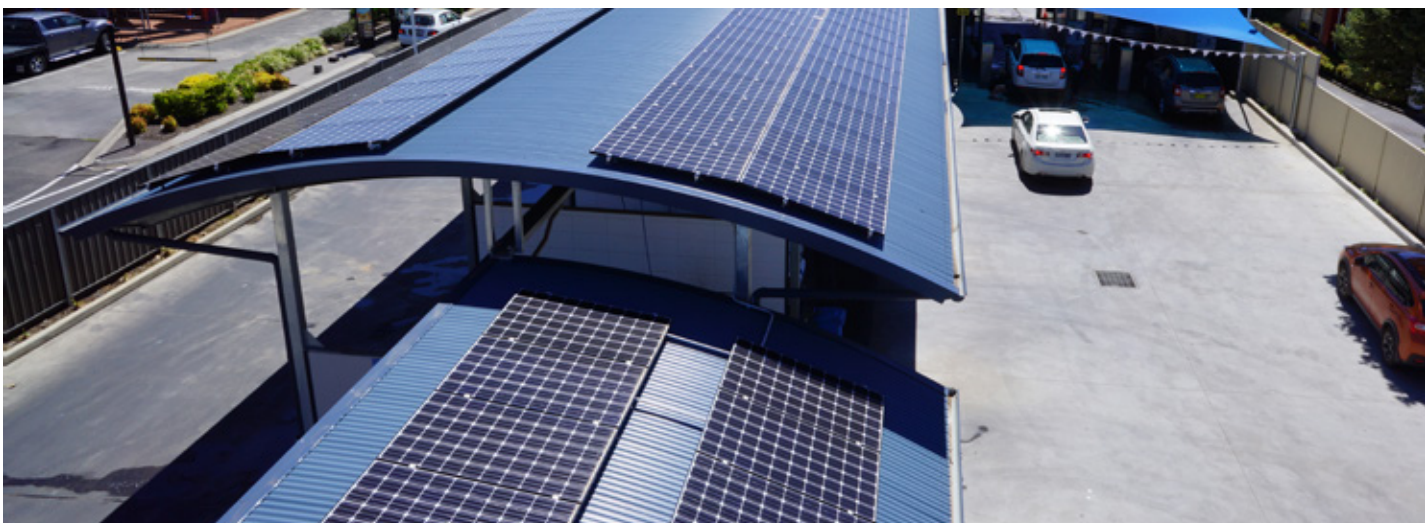
40 kW LG NeON system, carwash, Bathurst

Subject to the terms in this document, for modules manufactured from October 2017 onwards, being the A5 and V5 model range, LG will for a period of twenty five (25) years from date of original install authorise a free of charge repair or replacement (at LG's discretion) of the module, if in LG's opinion, it needs repair or replacement because of a manufacturing or materials defect appearing within, and notified to LG in accordance with this warranty. This warranty is only applicable to modules under normal applications, installations, use and service conditions.