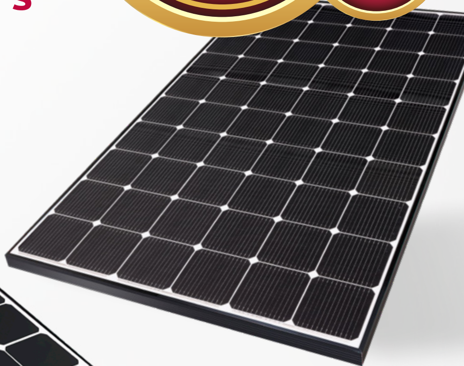
LG NeON ® 2